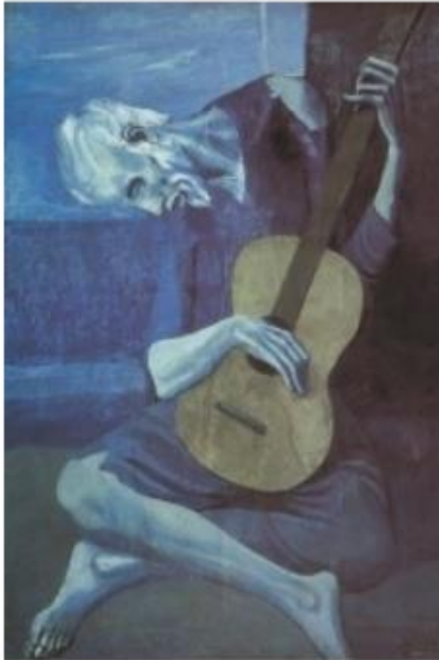
The old guitarist. 1903 Picasso

Pablo Picasso appreciated the power of blue. During his well-known Blue Period (1901-1904), he produced expressive paintings in a variety of blues.