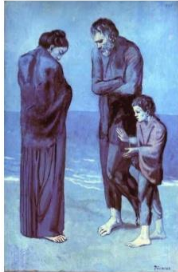
The tragedy. 1903, Pablo Picasso